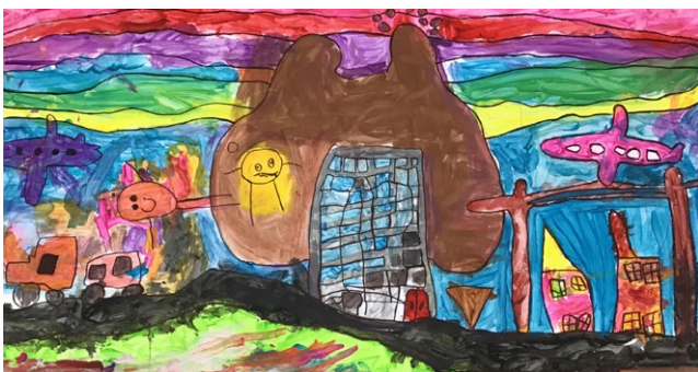
"This was a collaboration of our kindergarten children discussing things that they love about Australia. Each child drew their own ideas to create a stunning collaborative piece. Ideas regarding how our homes have electricity, family and friends, cars that drive on roads and planes, and how rainbows make us happy. I hope you enjoy our collaborative piece as much as we do."

To give you an idea of the types of images we are looking for, attached are some examples from previous years. These are just to give you an idea; please don't feel limited by these!